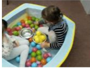
Organisation Application by Alpha Pre School

100% approved £3,192 project cost 108 said yes