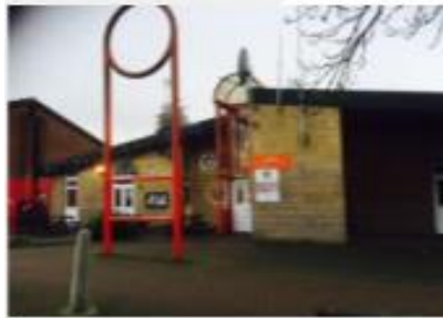
Chair at Toothill Community Centre